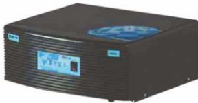
SP 900 & SP 1200